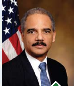
"The extraordinary efforts of the men and women we recognize today have awakened family after family from the nightmare of having a missing child..." U.S. Attorney General Eric Holder