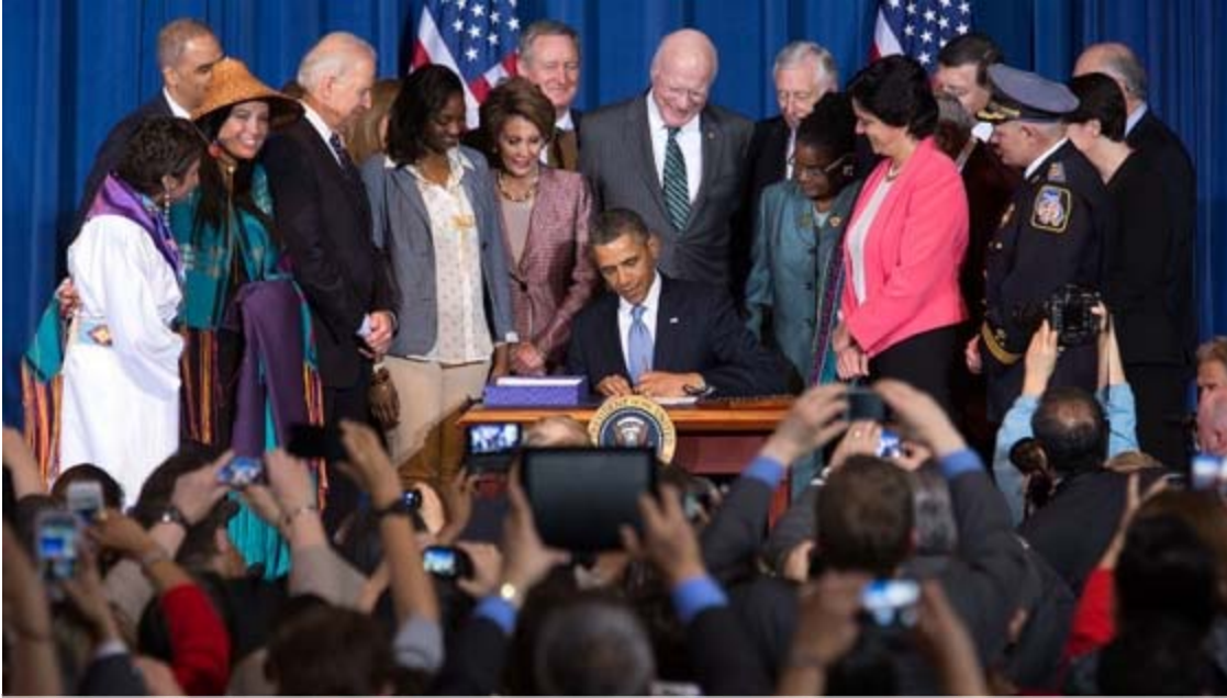
President Barack Obama signs S. 47, the “Violence Against Women Reauthorization Act of 2013,” (VAWA) in the Sidney R. Yates Auditorium at the U.S. Department of Interior in Washington, D.C., March 7, 2013.

It is up to all of us to ensure victims of sexual violence are not left to face these trials alone. Too often, survivors suffer in silence, fearing retribution, lack of support, or that the criminal justice system will fail to bring the perpetrator to justice. We must do more to raise awareness about the realities of sexual assault; confront and change insensitive attitudes wherever they persist; enhance training and education in the criminal justice system; and expand access to critical health, legal, and protection services for survivors.