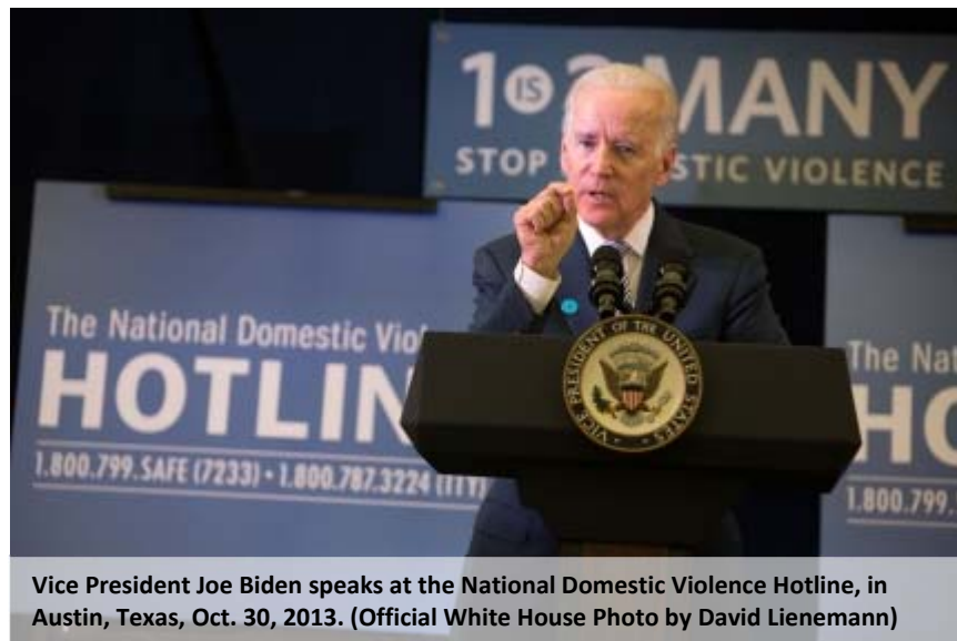
Vice President Joe Biden speaks at the National Domestic Violence Hotline, in Austin, Texas, Oct. 30, 2013.

The White House Council on Women and Girls and the Office of the Vice President also co-host an interagency working group on violence against women. This is a first-of-its kind forum for collaboration and information-sharing among key federal agencies about best practices to prevent sexual assault and to provide support for victims. This interagency group formulated recommendations for reauthorization of the Violence Against Women Act and developed other initiatives to respond to President Obama's call for action.