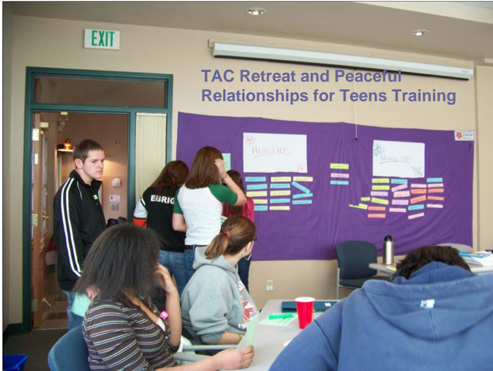
TAC Retreat and Peaceful Relationships for Teens Training, February 2010.