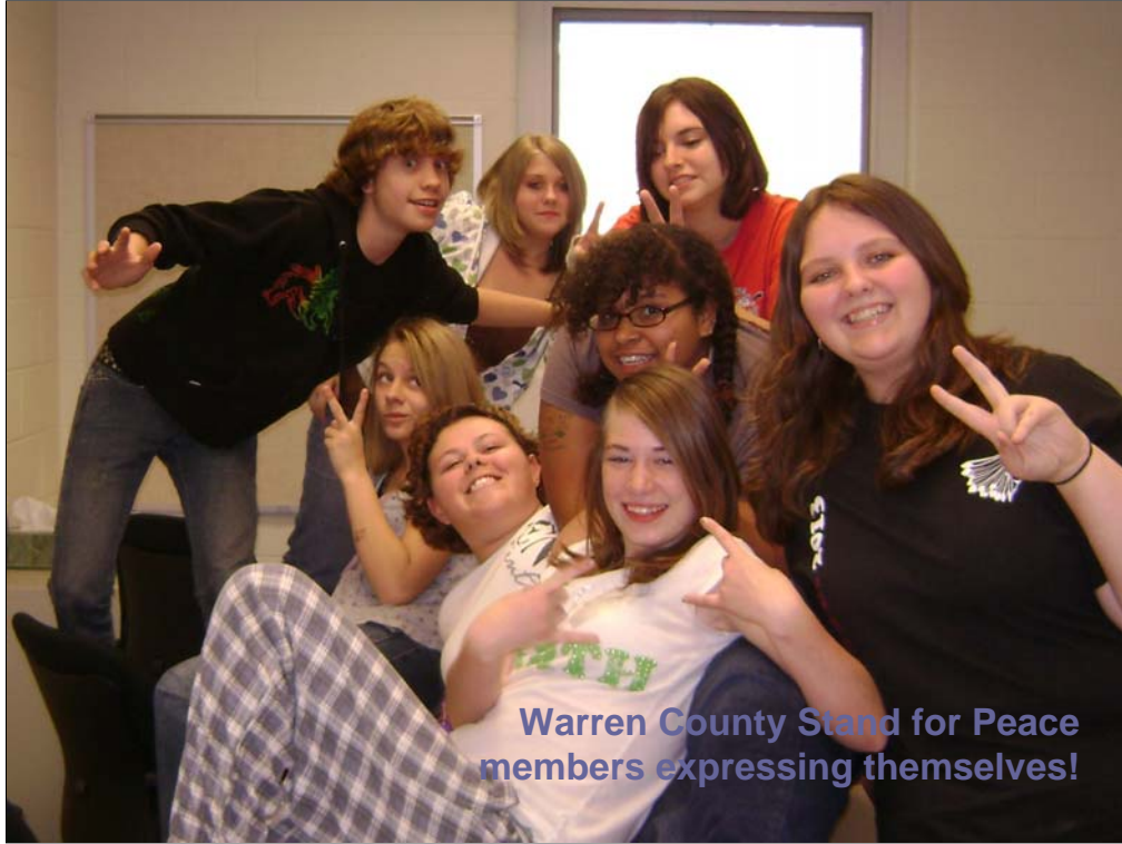
Warren County's Stand for Peace Teen Group