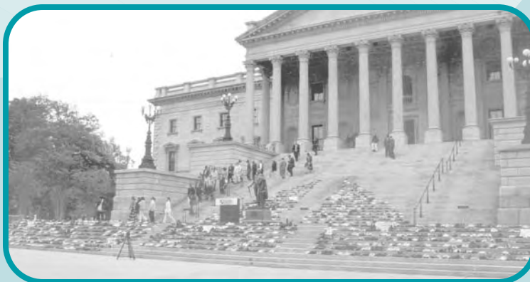
Shoes placed at the state capitol building in Columbia, SC.