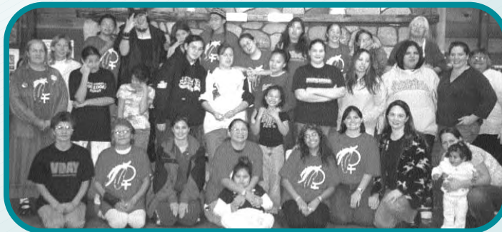
Native American Girls Retreat, Brainerd, MN October 2004.

The young women created their own skits about violence against young Native girls and women using Native puppets and animal puppet's. They developed a PowerPoint presentation of their interview questionnaire and conducted the interviews with one another. We are in the process of editing the footage and have yet to decide its use.